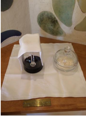
Back of the Church